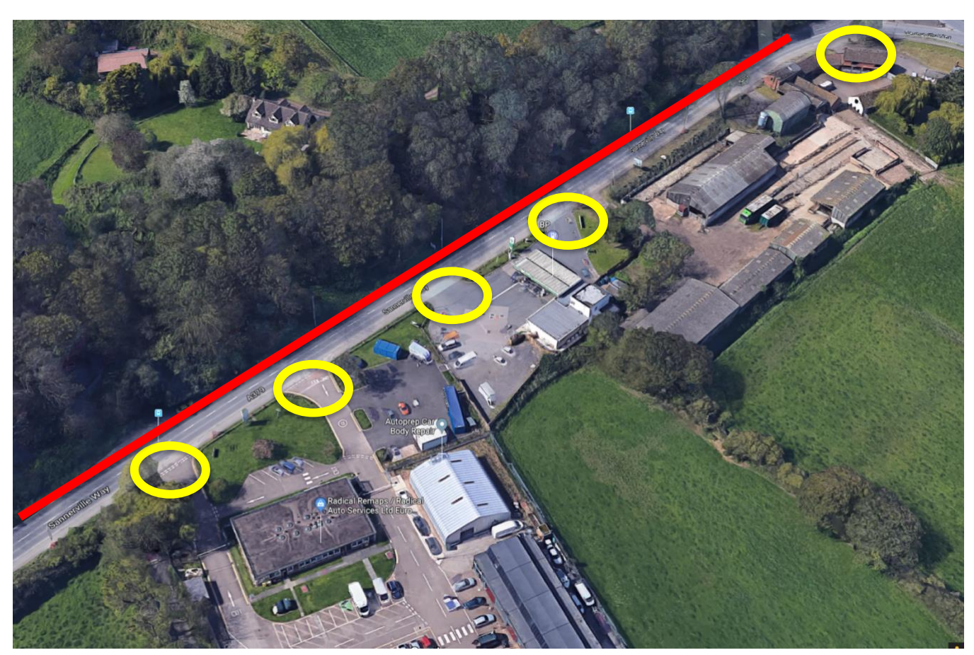
Image 7 – Current shared foot / cycle path along Sannerville Way. Yellow circles indicate the junctions that currently have to be crossed to get between Exminster and the proposed development. The red line shows space on the opposite side of the road where a new cycle path could be installed to provide a direct link to the new development and existing village of Exminster.