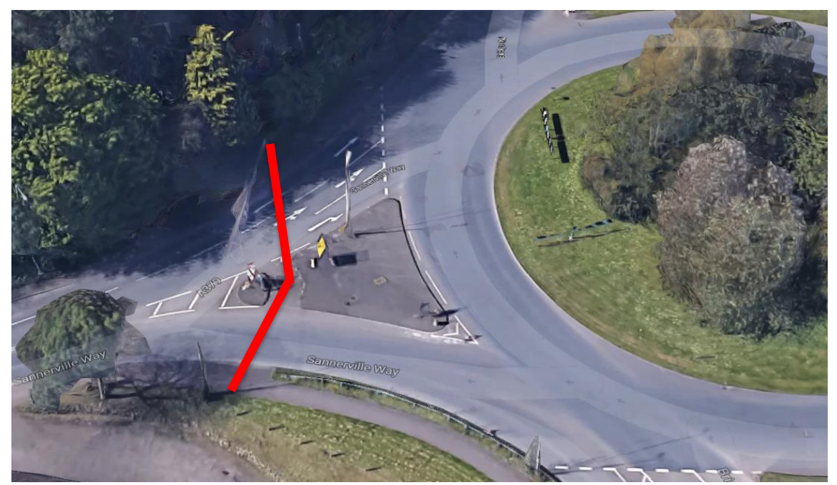
Image 6 – Current crossing point on a major busy roundabout to travel between proposed development and Exminster.