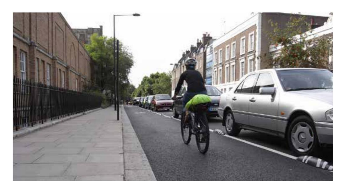
Image 2 – Segregated Cycle Lane, Royal College Street, Camden. Note that lane marking should be on the outside of the raised features.