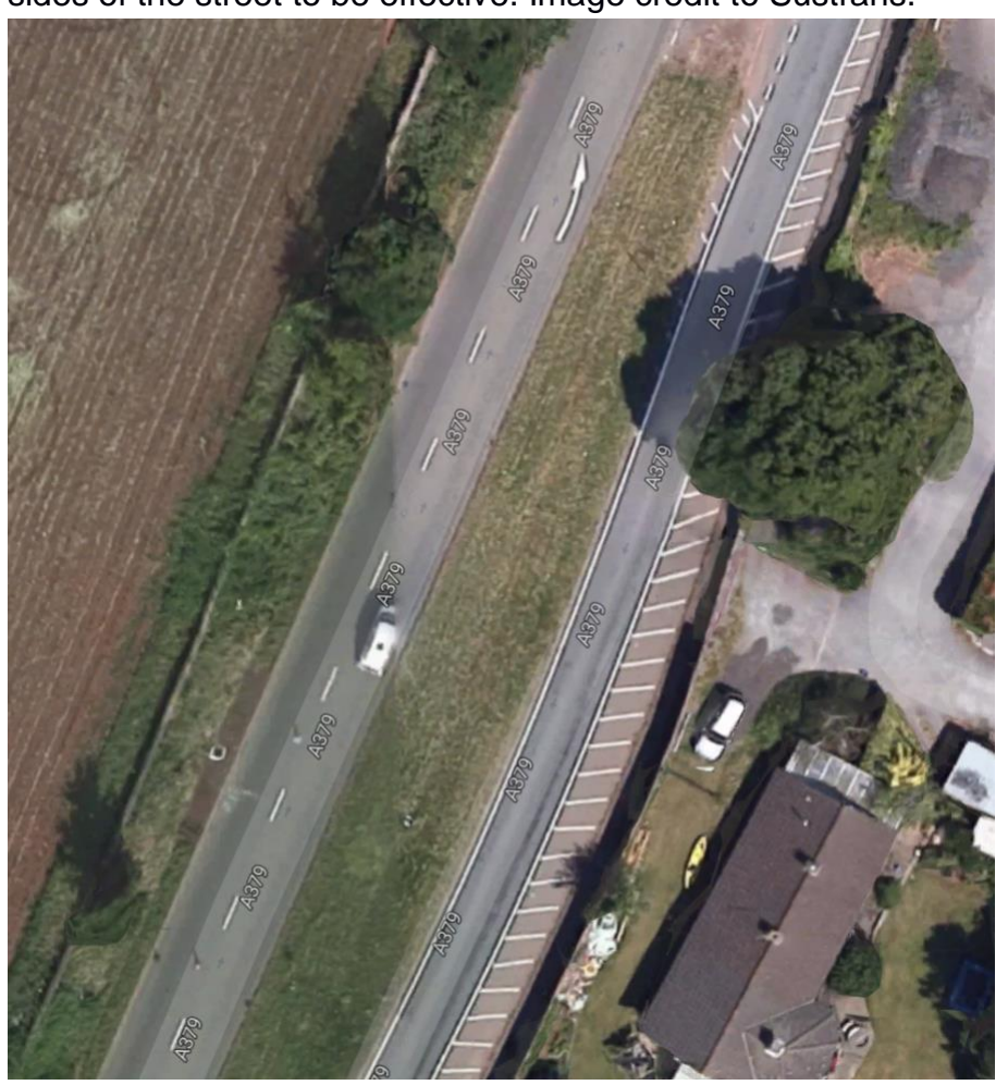
Image 4 – An aerial view of a section of the A379, showing unused space that could be reallocated to provide improved pedestrian / cycle facilities.