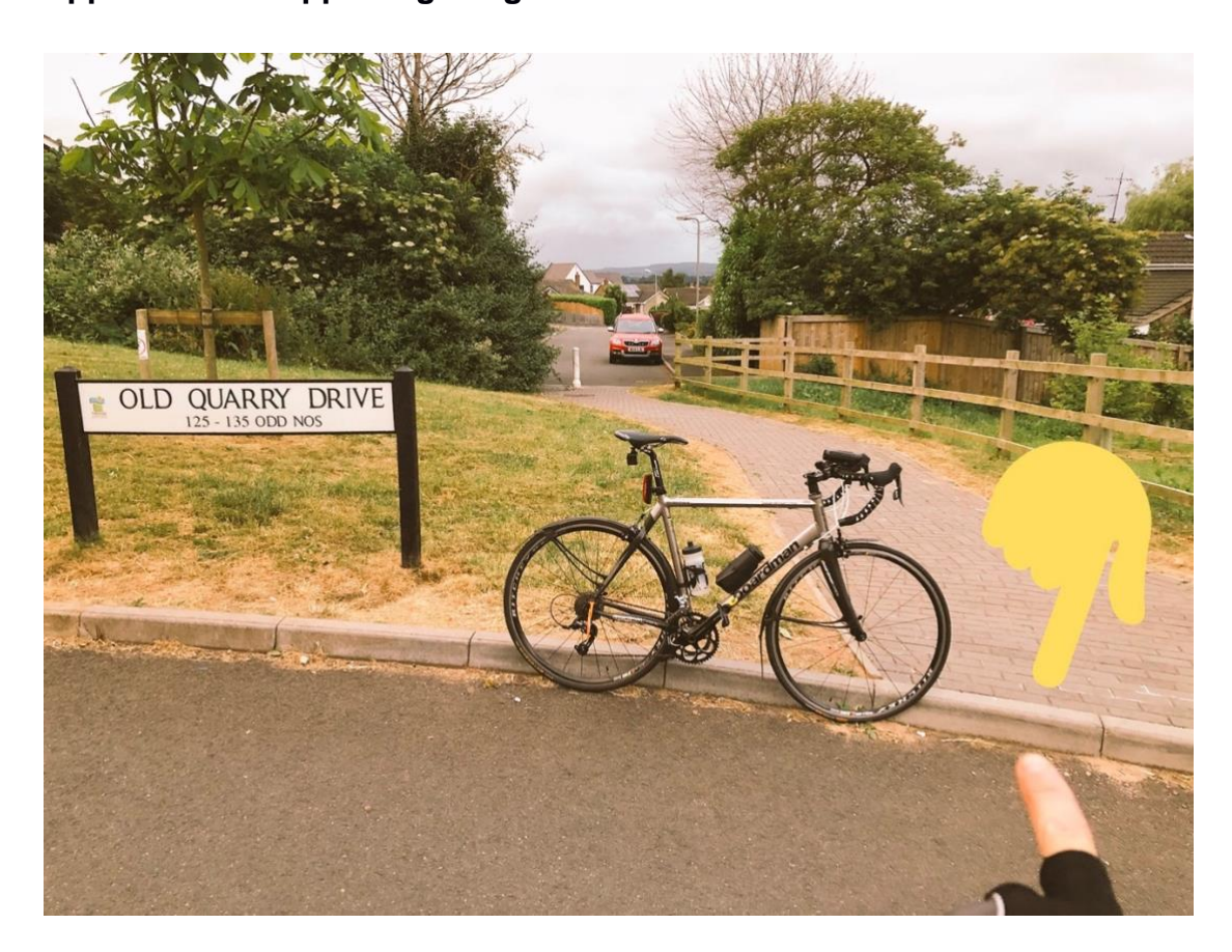
Image 1 – Milbury Reach development, Exminster – unusable filtered permeability due to high curb.