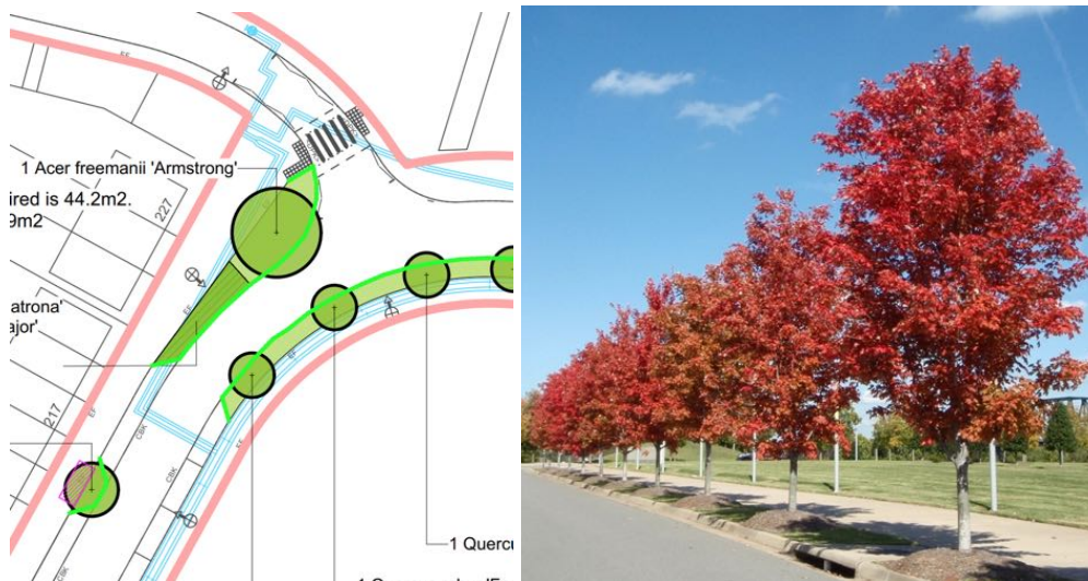
Figure 4: Planting at the corner of Tillhouse Road and Crannaford Way, along with an image showing the proposed type of tree on the corner potentially obscuring the crossing.