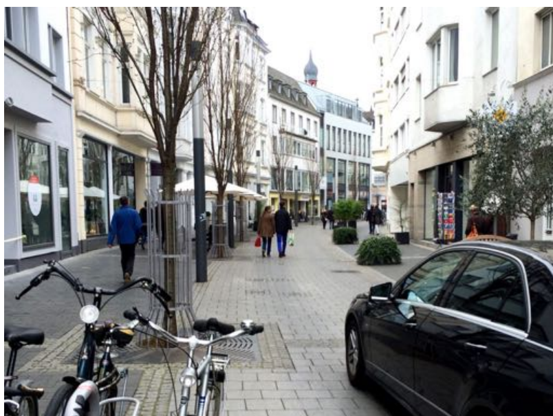
Figure 1: Friedrichstraße, Bonn, Germany, Credit: Tighe Lanning.

However the design for Cranbrook does not go as far as to remove the priority of motor vehicles, which would be a welcome step to create a safer, cleaner, and quieter town centre that encourages active transport, and deters cars using the route as a cut through.