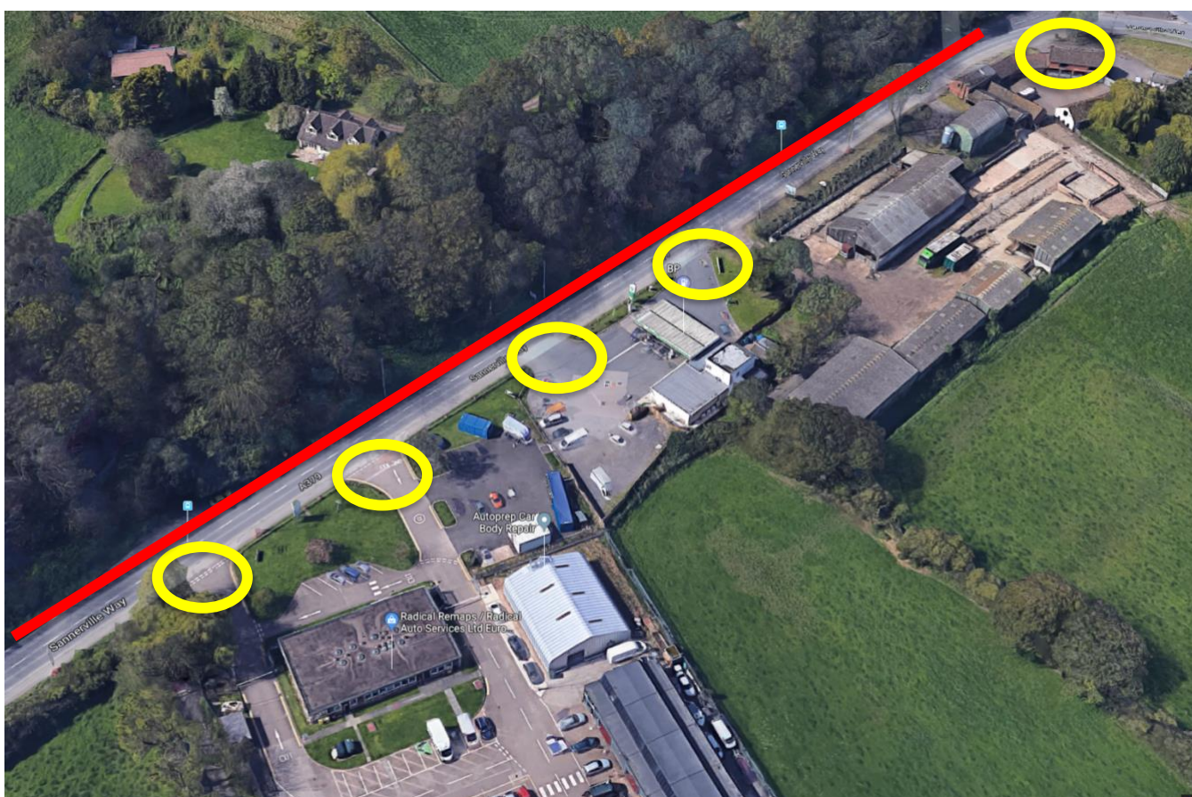
Image 7 – Current shared foot / cycle path along Sannerville Way. Yellow circles indicate the junctions that currently have to be crossed to get between Exminster and the proposed development. The red line shows space on the opposite side of the road where a new cycle path could be installed to provide a direct link to the new development and existing village of Exminster.