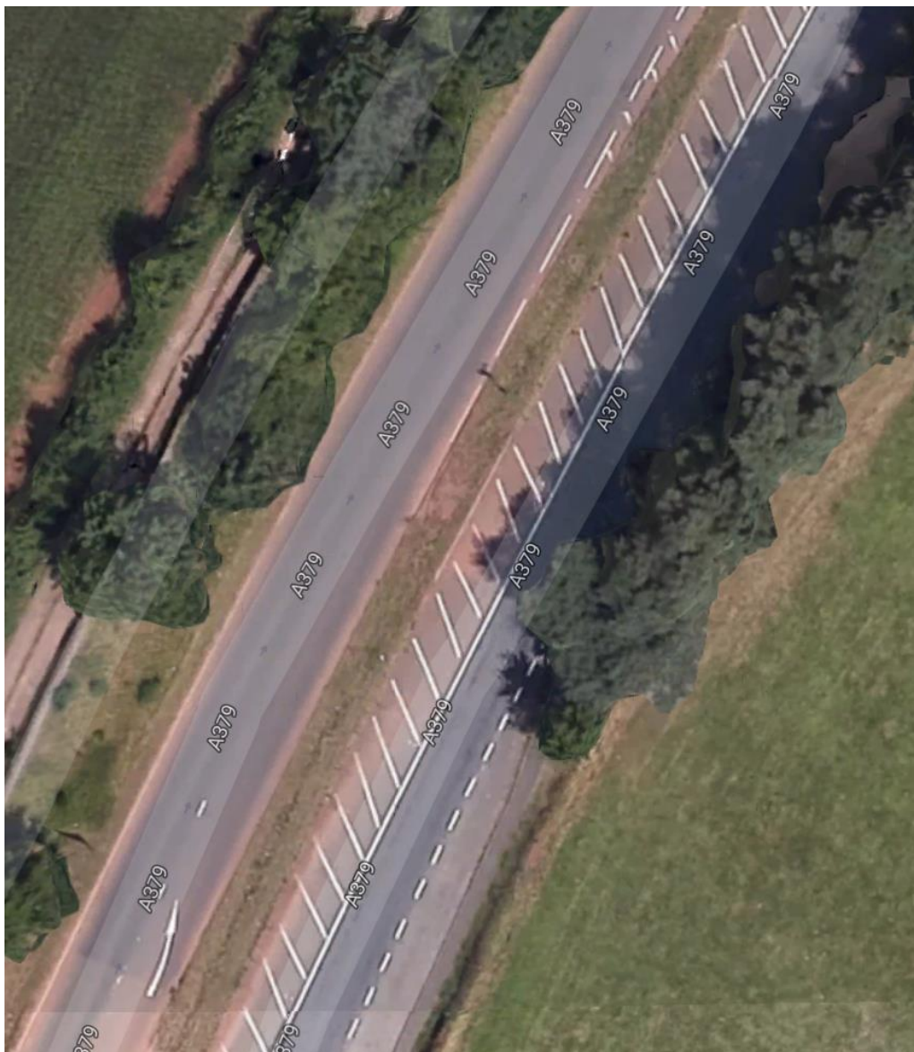
Image 5 – A second aerial view of a section of the A379, showing unused space that could be reallocated to provide improved pedestrian / cycle facilities.