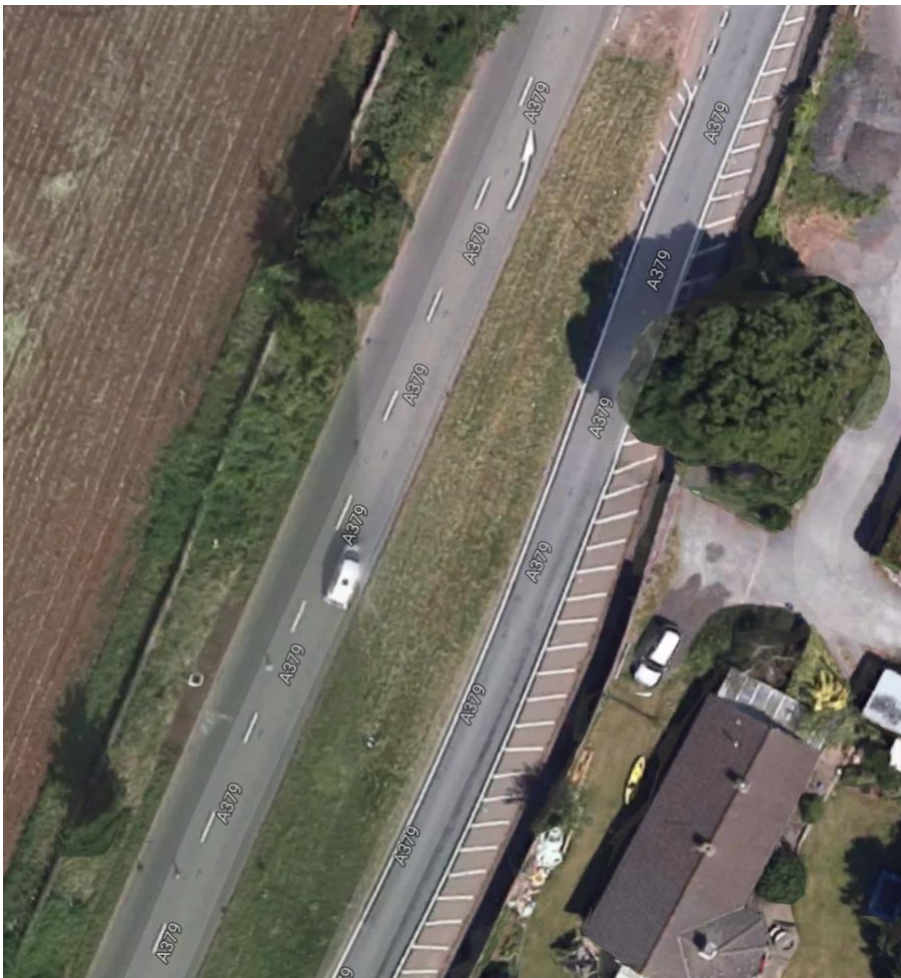
Image 4 – An aerial view of a section of the A379, showing unused space that could be reallocated to provide improved pedestrian / cycle facilities.