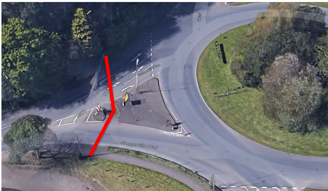
Image 6 – Current crossing point on a major busy roundabout to travel between proposed development and Exminster.