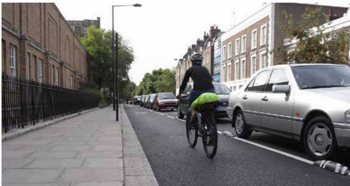
Image 2 – Segregated Cycle Lane, Royal College Street, Camden. Note that lane marking should be on the outside of the raised features.