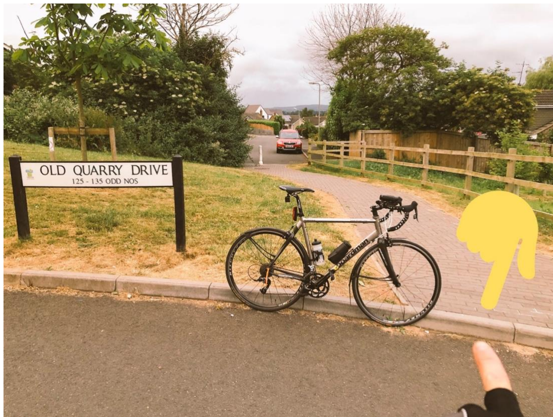
Image 1 – Milbury Reach development, Exminster – unusable filtered permeability due to high curb.