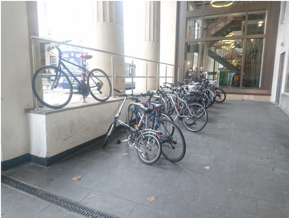
Figure A: Existing Phase 1 Cycle Parking on Queen Street is very well used and often over-capacity (picture taken 4.20PM Sunday 22nd October 2017). It is the only covered cycle parking in the city centre. This is proposed to be removed according to current plans, with no replacement. No cycle parking is proposed for the Phase 2 development. It is essential that Phase 1 provision is retained or replaced, and that extra provision is made for Phase 2. Consideration should be given to a high quality, high capacity cycle parking 'hub' for the Guildhall Centre and wider city centre.

Ideally, this should incorporate segregated cycle infrastructure along Paul Street, where the sloping topography, wide road design, and access/egress to multistory car parks encourage fast and often dangerous driving.